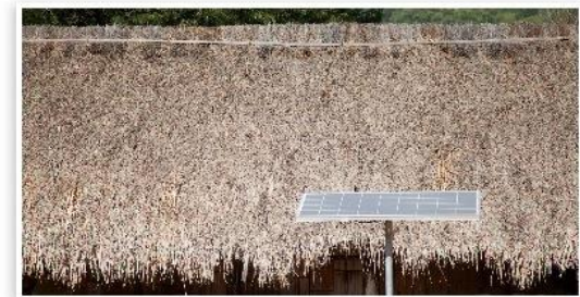
November 2012 – Solar Panel Installation

Lorem ipsum dolor sit amet, consectetur adipiscing elit, sed do eiusmod tempor incididunt ut labore et dolore magna aliqua. Ut enim ad minim veniam, quis nostrud exercitation ullamco laboris nisi ut aliquip ex ea commodo consequat. Duis aute irure dolor in reprehenderit in voluptate velit esse cillum dolore eu fugiat nulla pariatur. Excepteur sint occaecat cupidatat non proident, sunt in culpa qui officia deserunt mollit anim id est laborum.